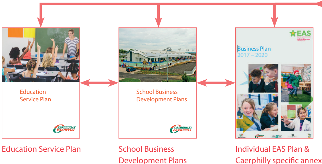
Education Service Plan